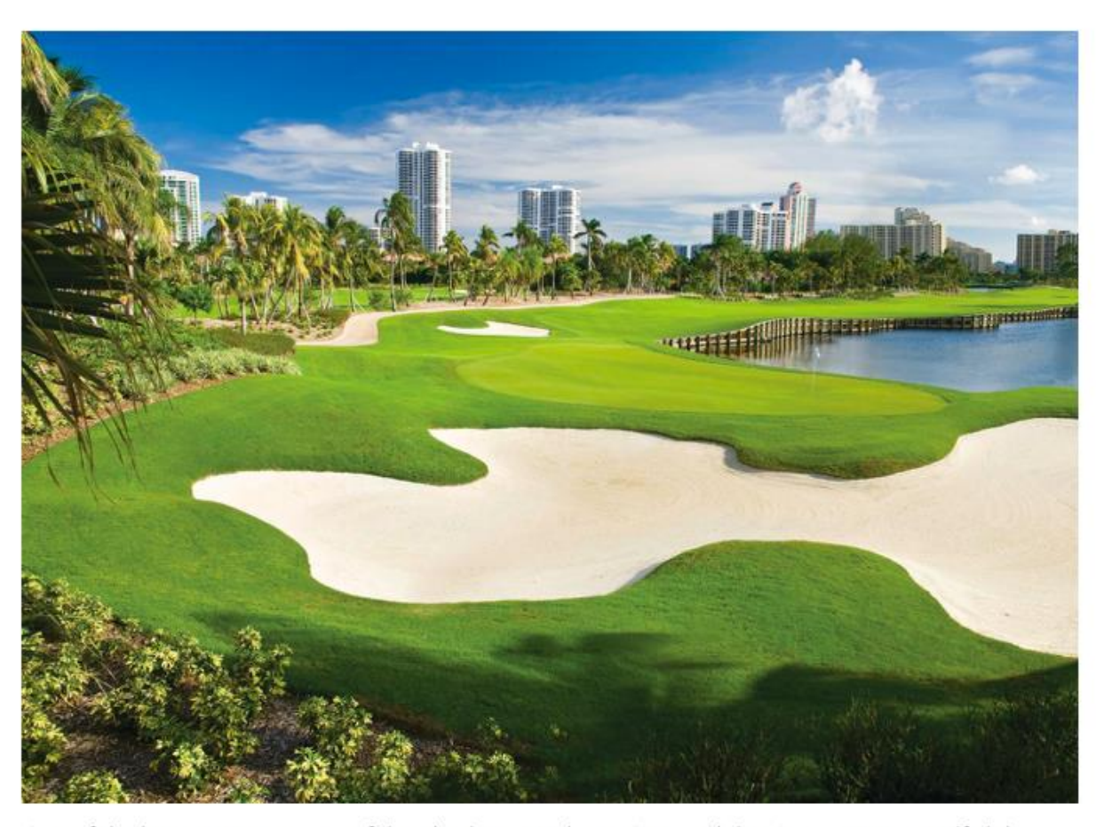
One of the biggest enticements of the ultraluxe Turnberry Ocean Club is its prestigious golf club, allowing golf lovers to take part in the sport just steps away from home.

Experience a gold standard of living at The Ritz-Carlton Residences. Situated on Miami Beach, the list of amenities at The Ritz-Carlton is far from short. The property has an on-site marina with 36 private boat dockages and a private on-site captained day yacht—providing you with the perfect daytrip adventure on the water. Bookworms can also immerse themselves in a library full of thought-provoking books. The library is filled with collectibles, artifacts, art and design books, enhanced by a collection of inspiring modern design pieces that complete the space. Along with this, The Ritz boasts a state-of-the-art fitness center, movie theater and a club room with a pool table and virtual golf to enhance day-to-day living with endless activities. The Ritz-Carlton Residences offers something for every type of man, allowing residents to indulge in the highest form of luxury and a life filled to its fullest. 4701 Meridian Ave. , Miami Beach , @theresidencesmiamibeach