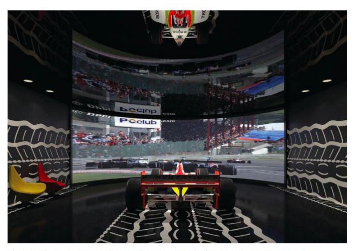
The Formula One racing simulator at The Estates at Acqualina

The Estates at Acqualina collaborated with Reddymade Architecture & Design to design Villa Acqualina, an ultraluxe residential complex with a wide range of amenities that will make you never want to leave the building. The four-level complex features the Wall Street Traders Club—a business room for like-minded individuals to come together. Enjoy the benefits of work and play, as you're able to take care of business in a sociable environment while following market trends and trades. After a long week of work, residents can unwind with a full floor of fun featuring all sorts of stimulating activities, from an ice-skating rink to a bowling alley, movie theater and even a Formula One racing simulator—which is so realistic that it allows you to pilot a superfast Formula One car or drift in a 4WD rally car around the dirt. The residences are aimed to open in late 2021 and will be located on the grounds of the five-star, five-diamond Acqualina Resort & Residences on the Beach, where residents can expect nothing less than iconic ocean views and pure paradise. 17895 Collins Ave., Sunny Isles Beach, @estatesatacqualina